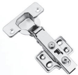
Model : SS Soft Closing Hinge