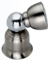
Model : SS Bell Type Door Holder