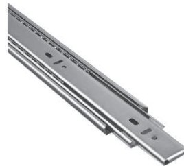
Model : SS Telescopic Channel (Heavy Duty)