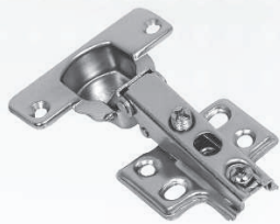
Model : Auto Hinge - Non Hydraulic