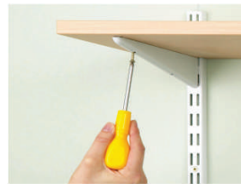
Model : Slotted Channel & Shelf Bracket