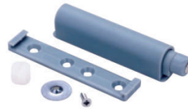
Model : Sleek Smart Push Catcher